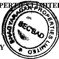
SRINIVAS DUDAM AUTHORISED SIGNATORY